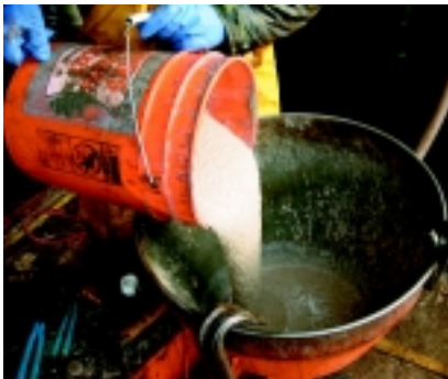
SeaShield 550 Epoxy grout being mixed and poured into pump.

The SeaShield 550 Epoxy Grout is a 3-component water displacing epoxy resin/aggregate formulation which provides a durable, well bonded repair to concrete, steel and timber piles below water. The 550 Epoxy Grout can be easily pumped into the Fiber-Form Jacket due to its excellent flowability characteristics.