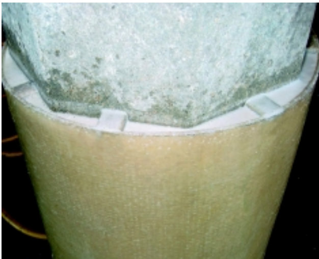
SeaShield 550 Epoxy grout pumped into the annulus around an existing octagonal concrete pile.