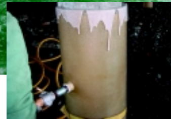
SeaShield 550 Epoxy Grout being pumped into the SeaShield Series 500 Fiber-Form Jacket.